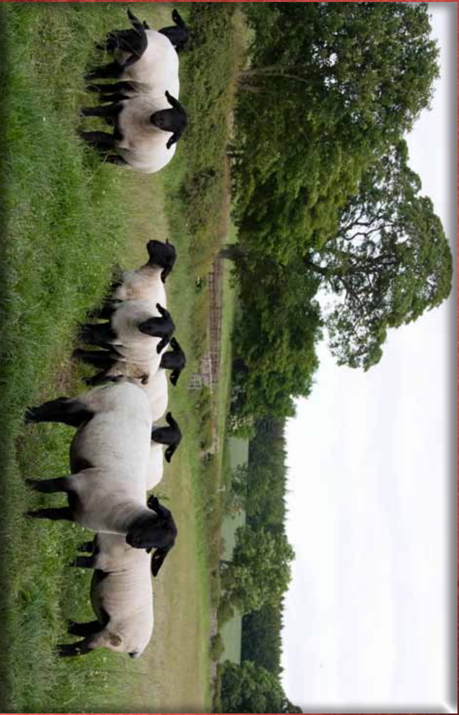
Shearling Gimmers sired by Glenhead Infusion