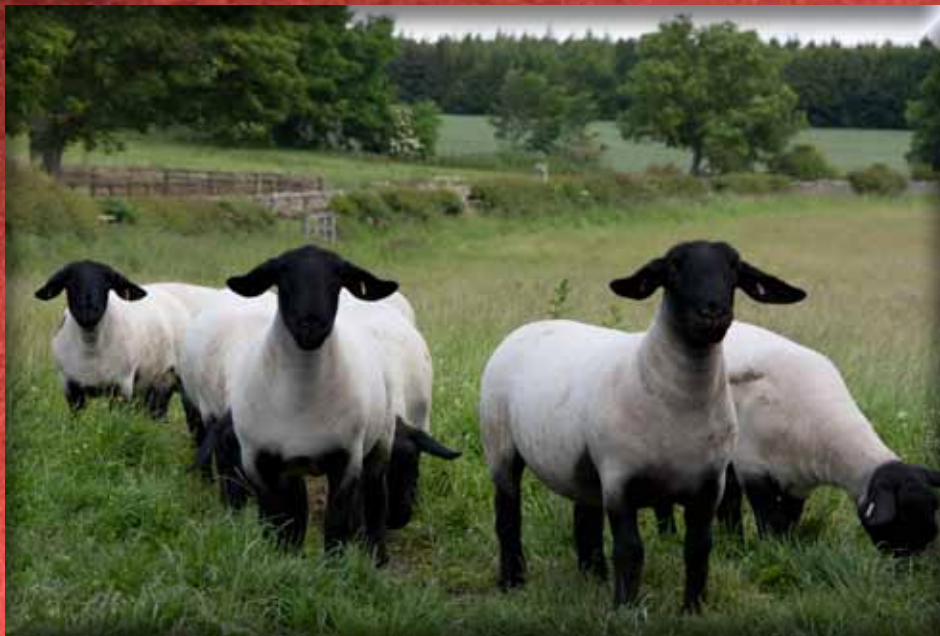
Shearling Gimmers sired by Glenhead Infusion