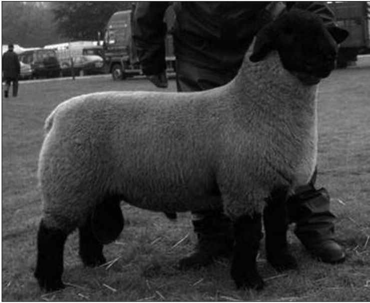
"SITLOW SENSATION – Full Brother to Lot 86"

87 45Z:J96 Twin Born: 11/01/2007 Sire: DIDCOT DYNAMIC (91591) Dam: 45Z:F64 by PERRINPIT HIGH PEAK (88525) G.Dam: 45Z:C18 by STRATHISLA SINATRA (87633)