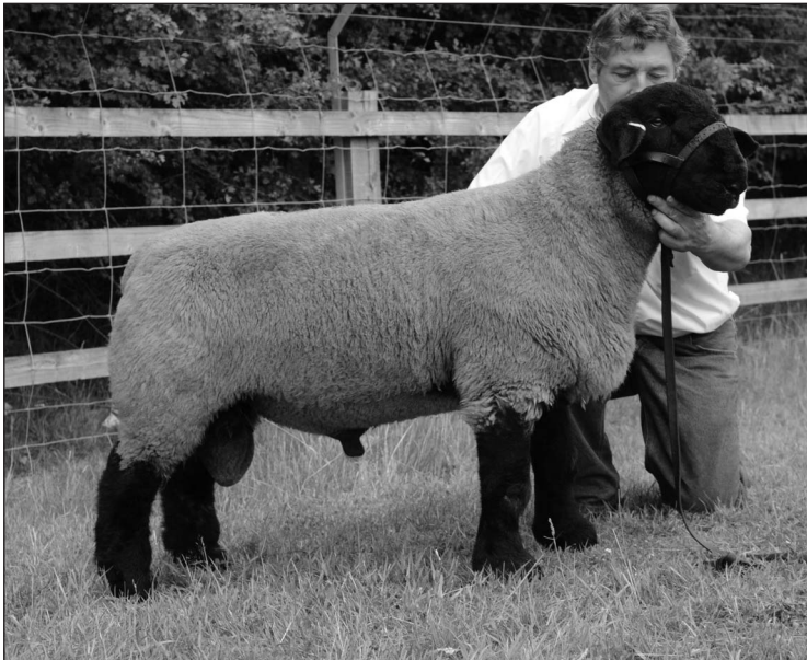
"STOCKTON JOINT VENTURE – Service sire for Lots 36 to 54"

STOCKTON JOINT VENTURE was purchased for 8000 gns National Sale 2010. He won Champion Ram Gloucester and Adjacent Counties Flock Competition 2011 and Reserve Champion Midland and Eastern Area Flock Competition 2011. He sired Champion Ewe Lambs Midland and Eastern Area Competition 2011. He is by the Rhaeadr Radar son, Stockton Thriller The Second.