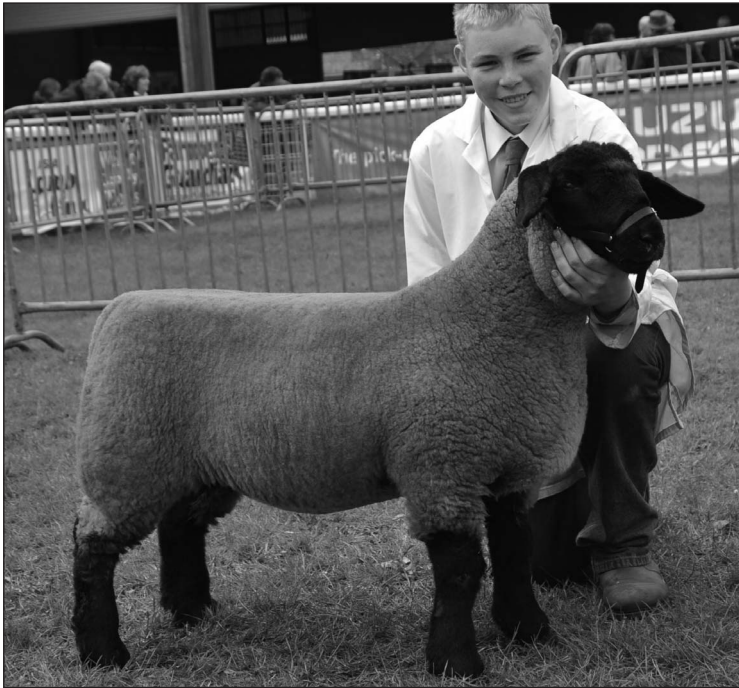
"J99:11:021 – Reserve Champion Royal Welsh Show 2011 (Lot 142)"