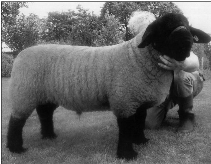
"SAFADDAN SADDAM – Service Sire to some of the Pexhill Gimmers"

SAFADDAN SADDAM is by Strathisla Stoner. His dam was a 1600 gns ewe lamb bred in the Rhaeadr Flock and purchased at the Beeston Sale. His ET brother was Breed Champion at the Three Counties Show. He has developed into a very strong, correct ram.