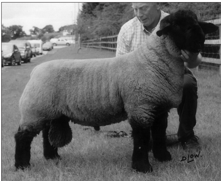
"PEXHILL REAL LUCKY – Service Sire to some of the Pexhill Gimmers"

PEXHILL REAL LUCKY won Champion Great Yorkshire 2 nd prize National Sale 2010 and sold for the second highest price of 13500 gns to the Cairness Flock. We were allowed to retain a share. He has bred very well in his first season and sired two members of the 1 st prize Team of Three as well as the overall Champion at Stirling 2011. Also sired the Champion Ram Lamb at Carlisle this year.