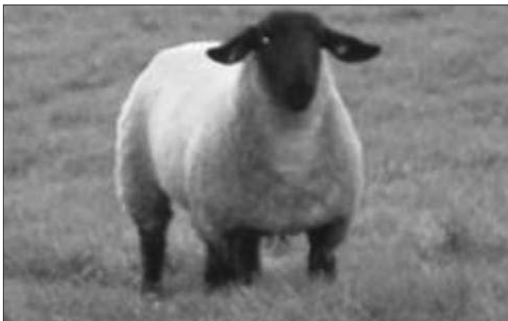
"Ewe Lamb11:001 Lot 175

11:001 is an outstanding ewe lamb and has won many first prizes at local shows this year. Her twin brother sold for 1700 gns to the Orkney based Didcot Flock at the National Sale this year. Her dam sells as Lot 62