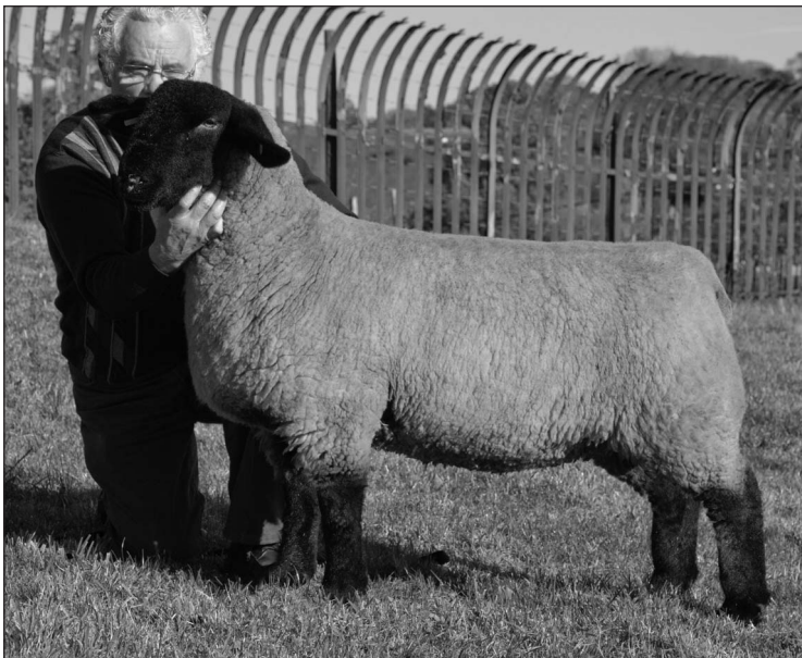
"Ewe Lamb – OVERALL CHAMPION BEESTON FEMALE SALE 2010 – Daughter of Lot 57"